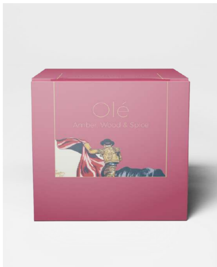
OLE Amber, Wood & Spice