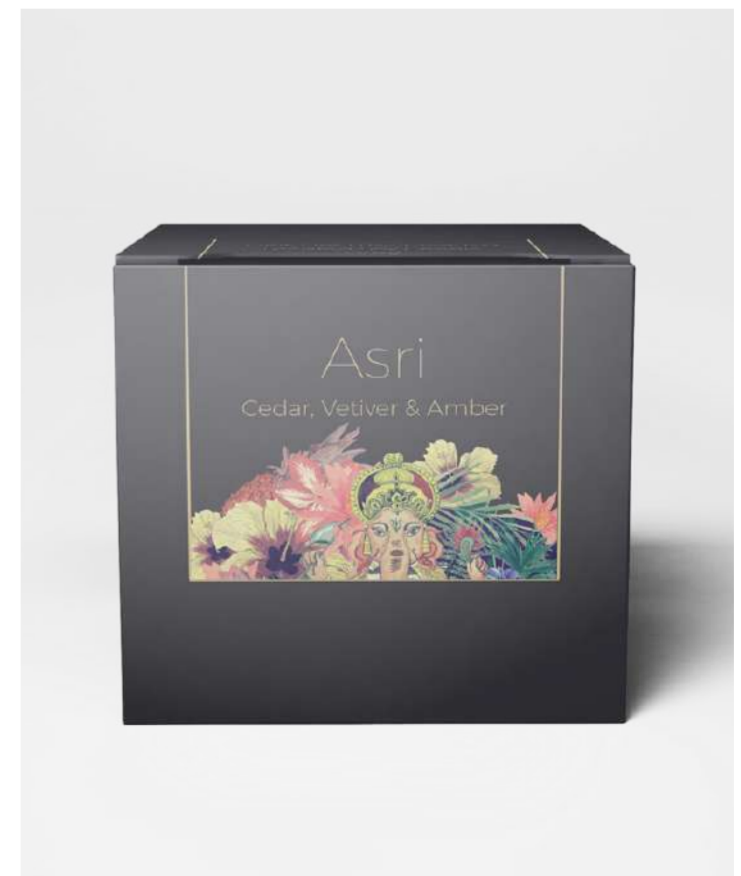
ASRI Cedar, Vetiver & Amber