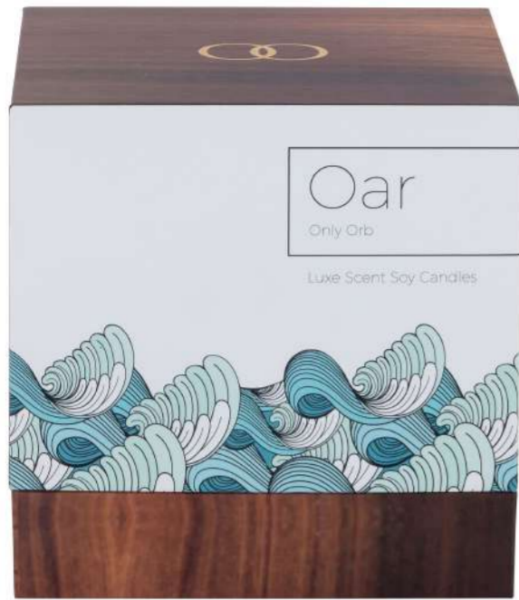
OAR Driftwood & Citrus