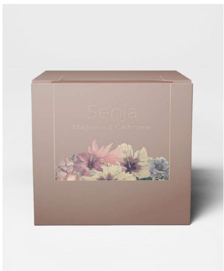
SENJA Magnolia & Cashmere