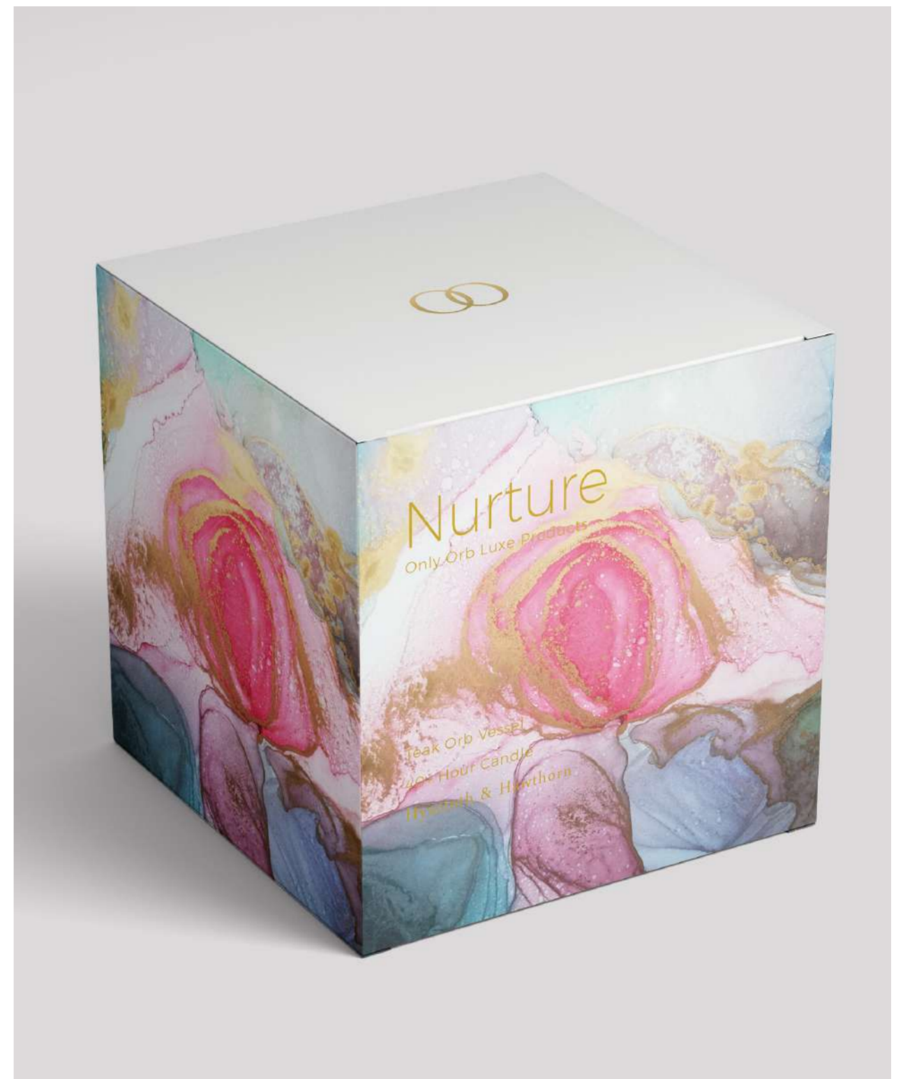
NURTURE Hyacinth & Hawthorn Teak Orb Gift Set