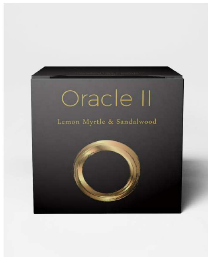
ORACLE II Lemon Myrtle & Santalwood