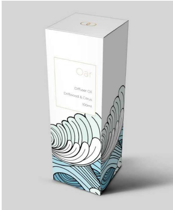
OAR Driftwood & Citrus