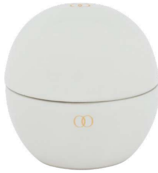
Milk White Ceramic Vessel