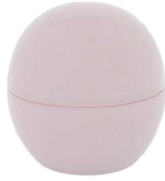
Soft Pink Ceramic Vessel