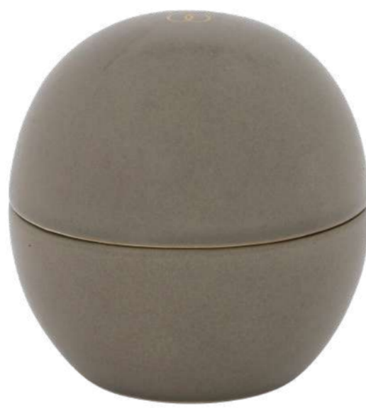
Olive Green Ceramic Vessel