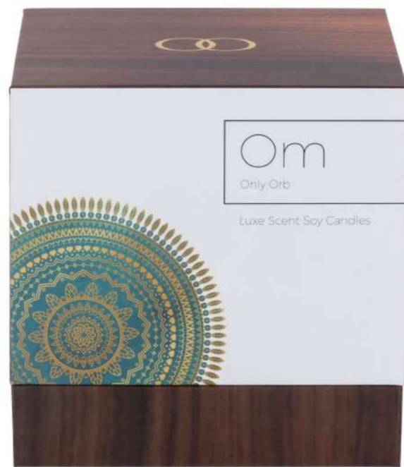
OM Fig & Teak