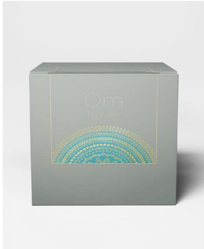
OM Fig & Teak