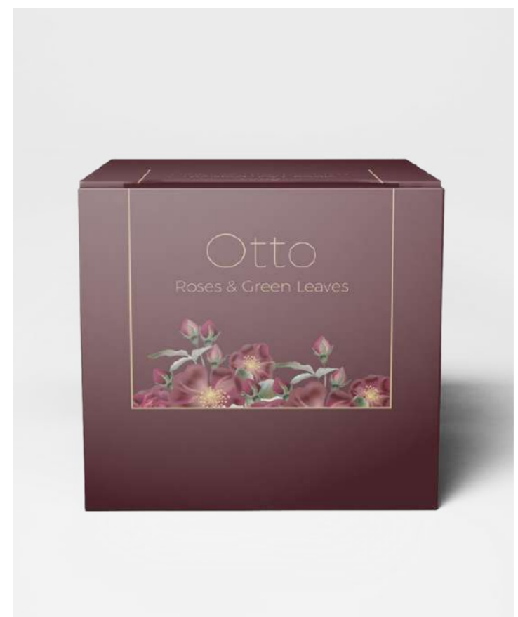
OTTO Roses & Green Leaves