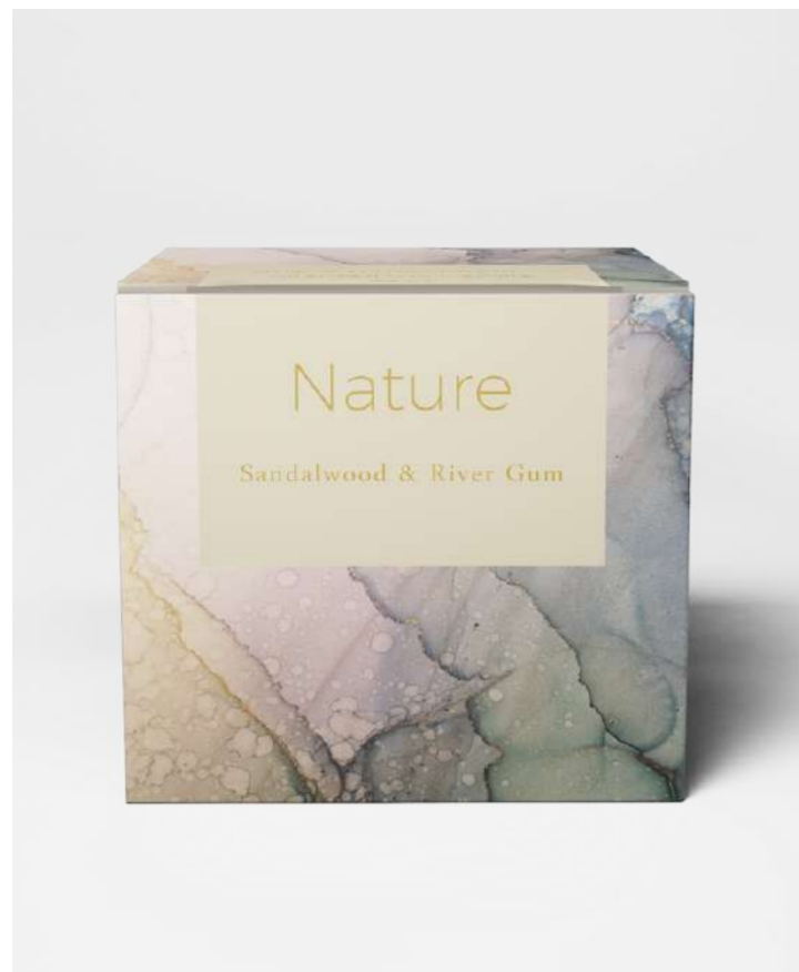
NATURE Santalwood & River Gum