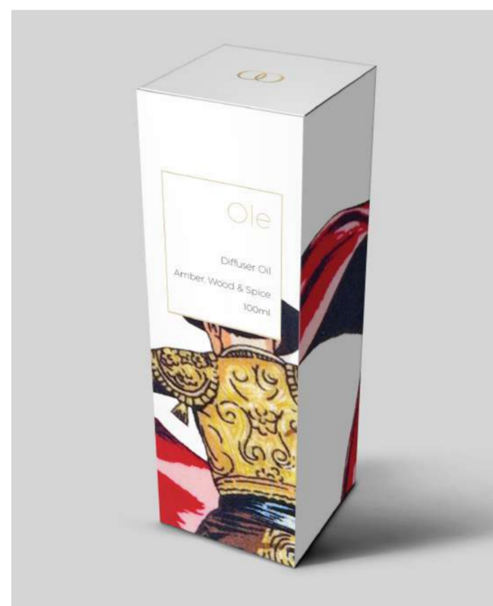
OLE Amber, Wood & Spice