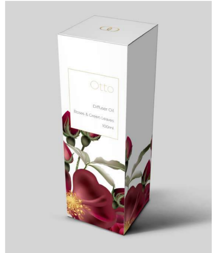
OTTO Roses & Green Leaves