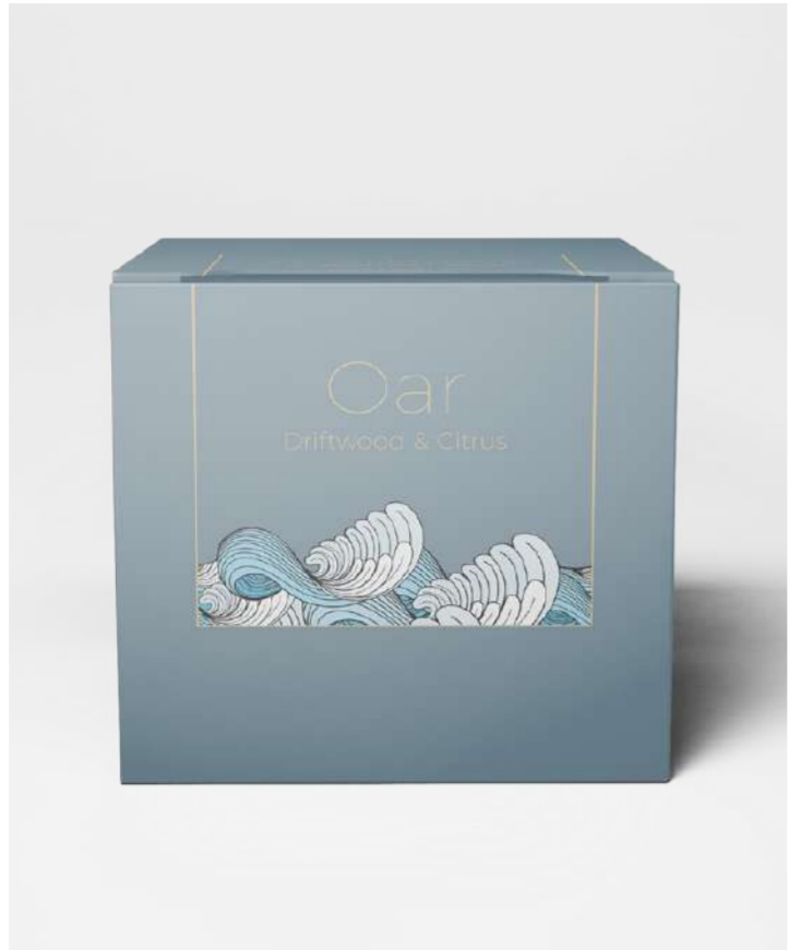
OAR Driftwood & Citrus