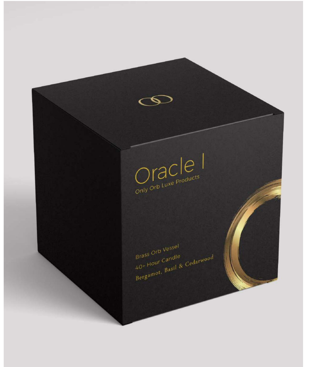
ORACLE I Bergamot, Basil & Cedarwood