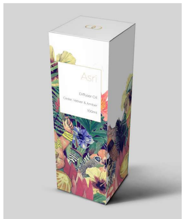
ASRI Cedar, Vetiver & Amber