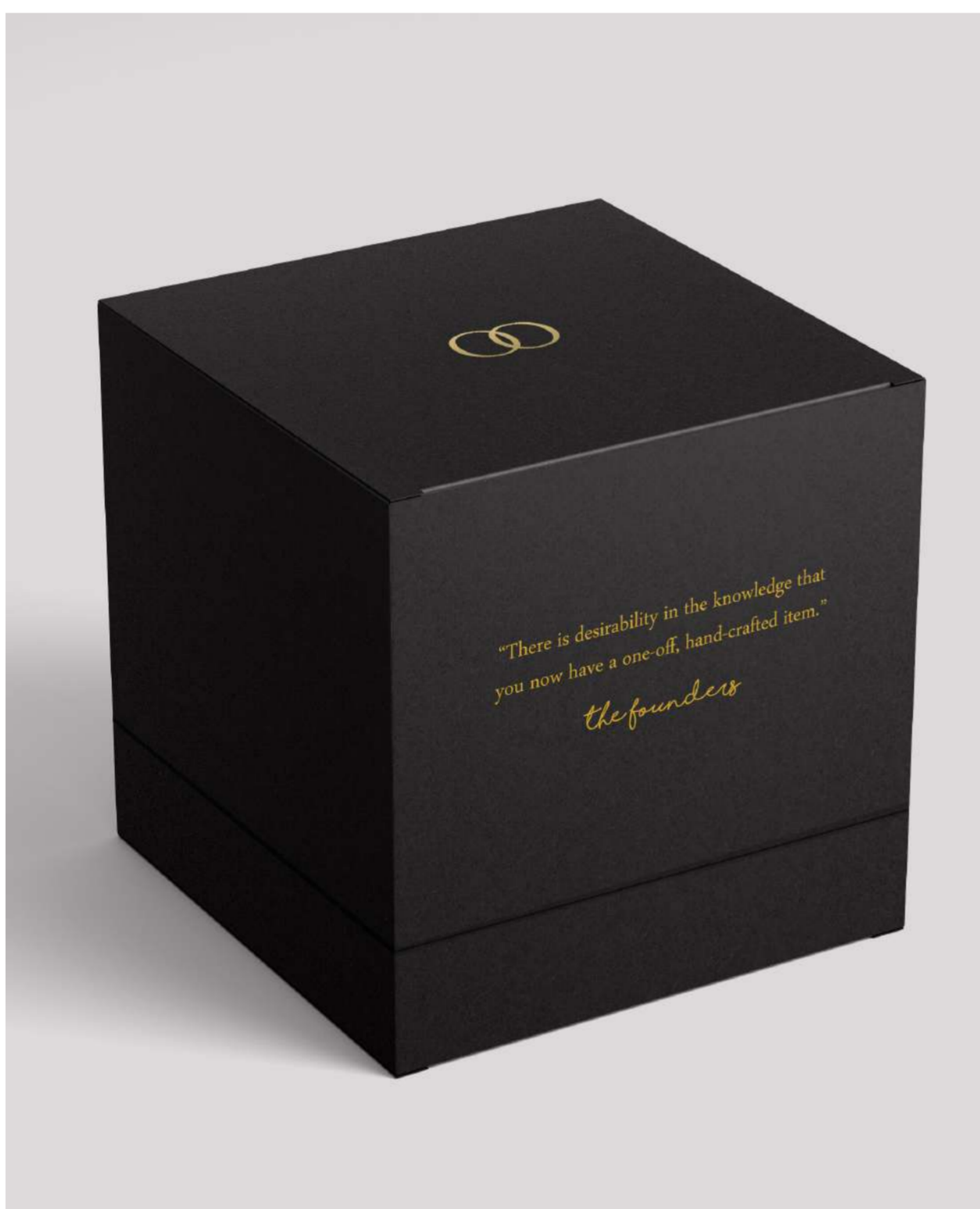
THE BOX BENEATH THE SLEEVE