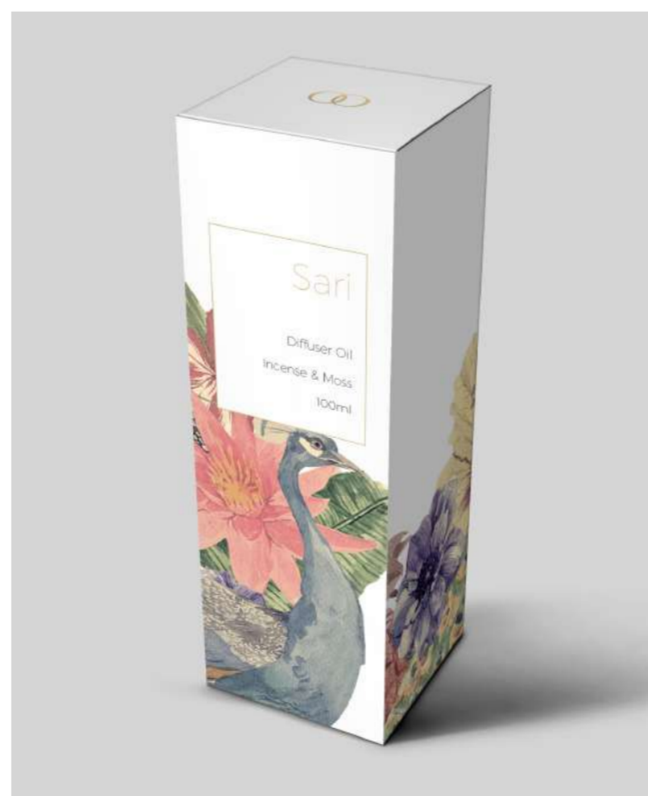
SARI Incense & Moss