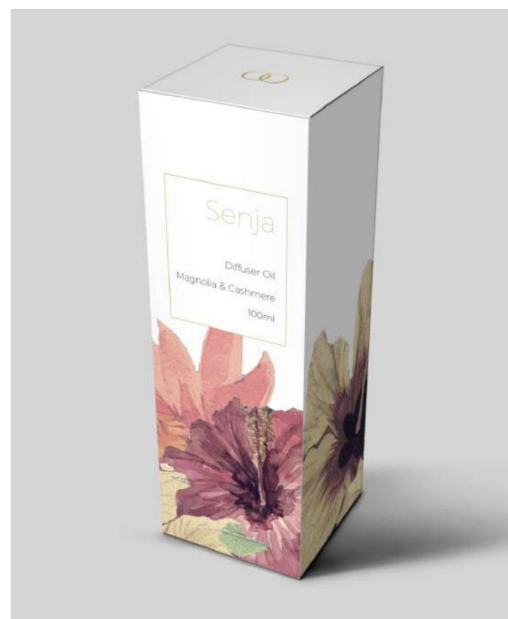
SENJA Magnolia & Cashmere