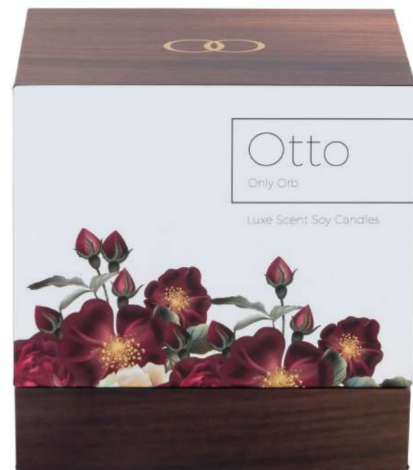
OTTO Roses & Green Leaves