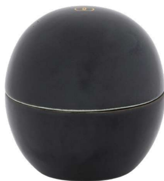
Matte Black Ceramic Vessel