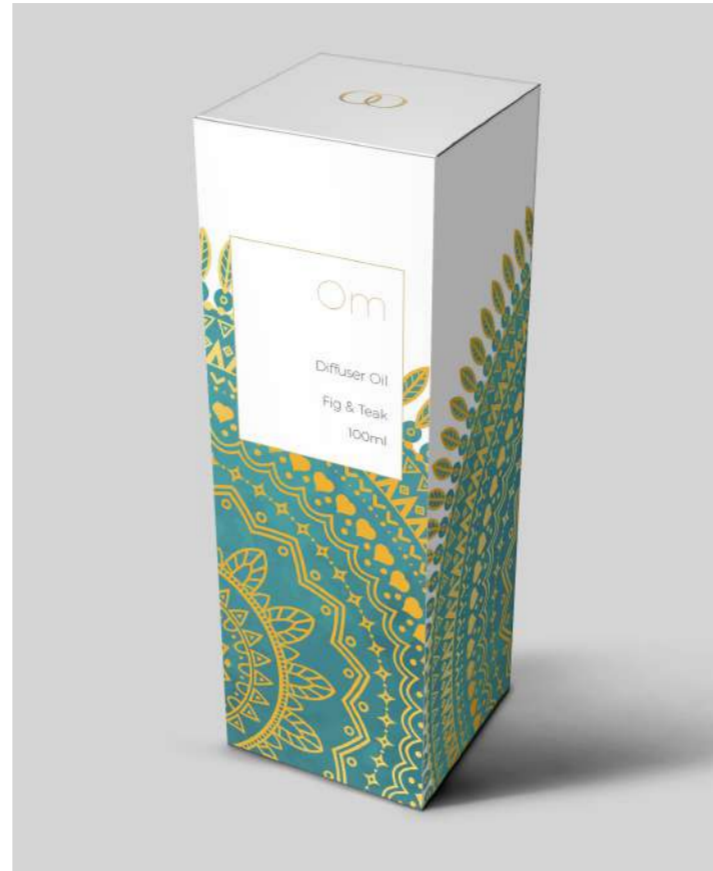
OM Fig & Teak