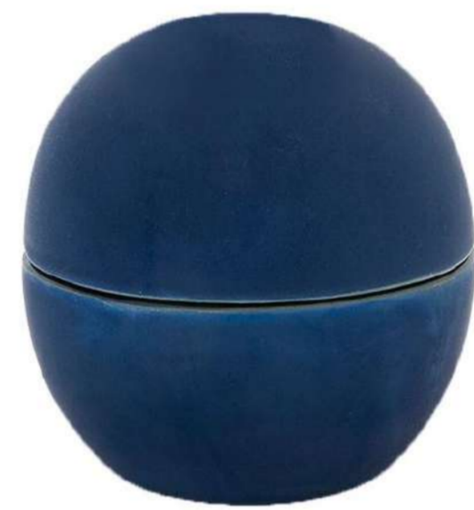
Navy Blue Ceramic Vessel