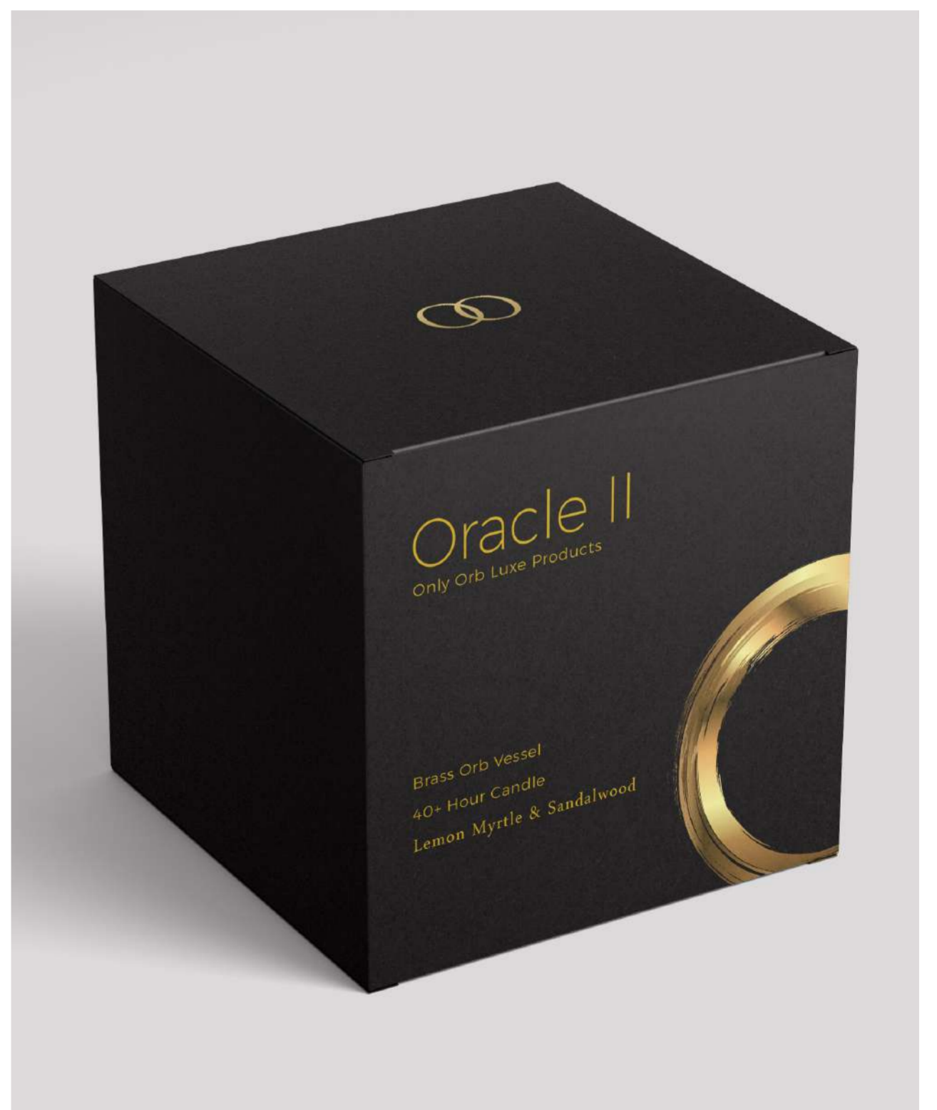
ORACLE II Lemon Myrtle & Sandalwood