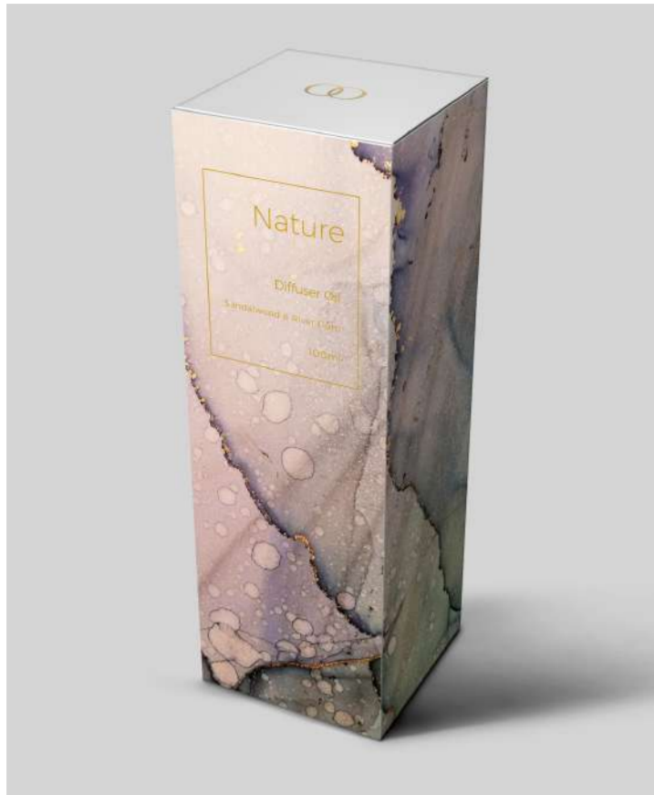
NATURE Santalwood & River Gum