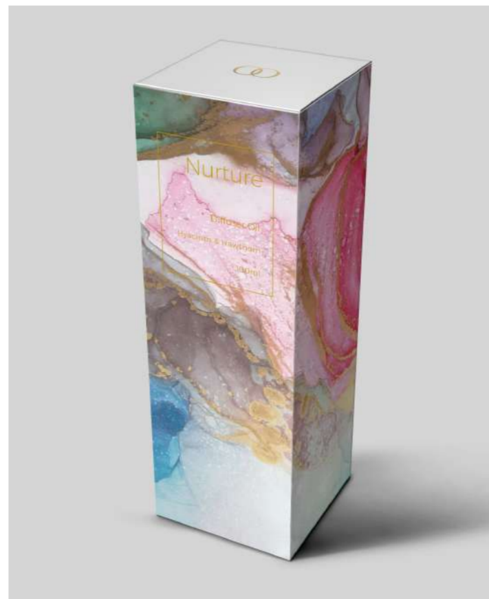
NURTURE Hyacinth & Hawthorn