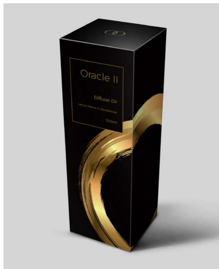
ORACLE II Lemon Myrtle & Sandalwood