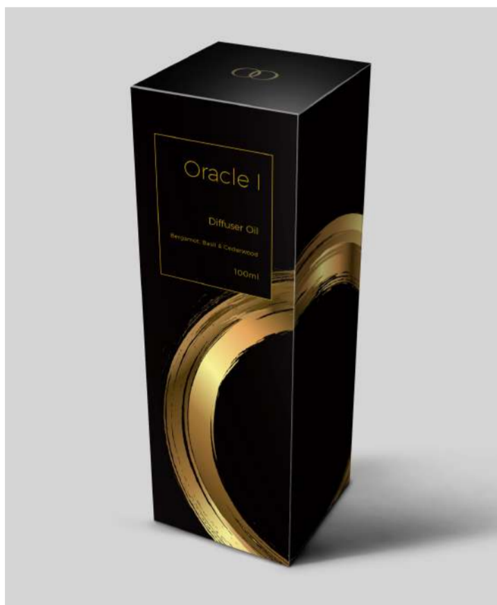
ORACLE I Bergamot, Basil & Cedawood