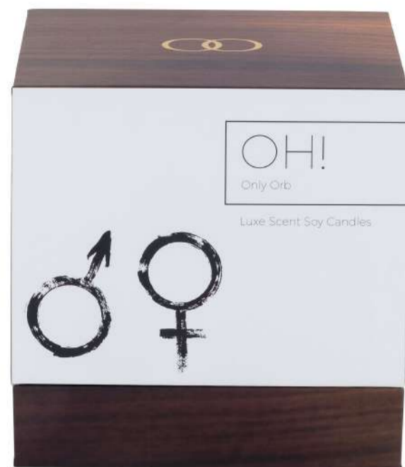
OH! Bergamot & Vetiver