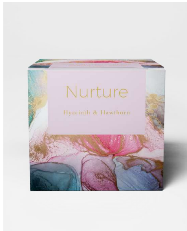
NURTURE Hyacinth & Hawthorn