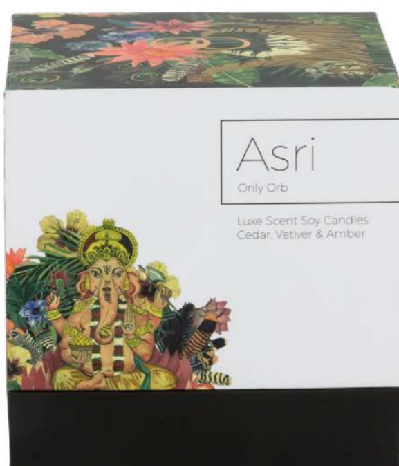
ASRI Cedar, Vetiver & Amber