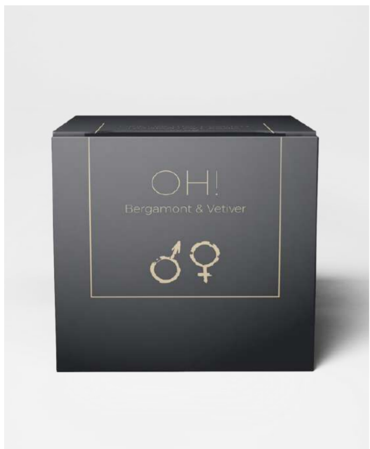
OH! Bergamot & Vetiver