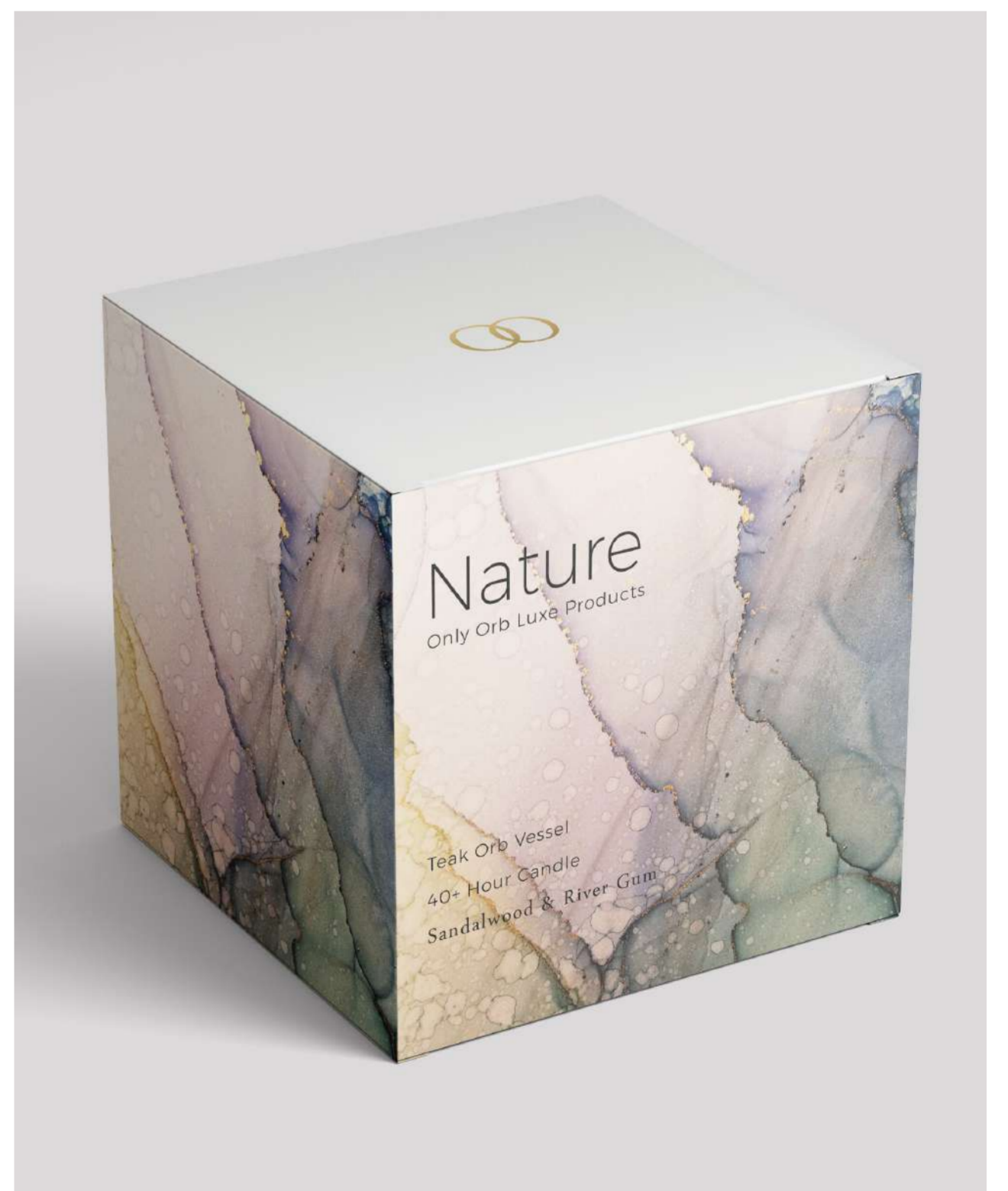
NATURE Sandalwood & River Gum Teak Orb Gift Set