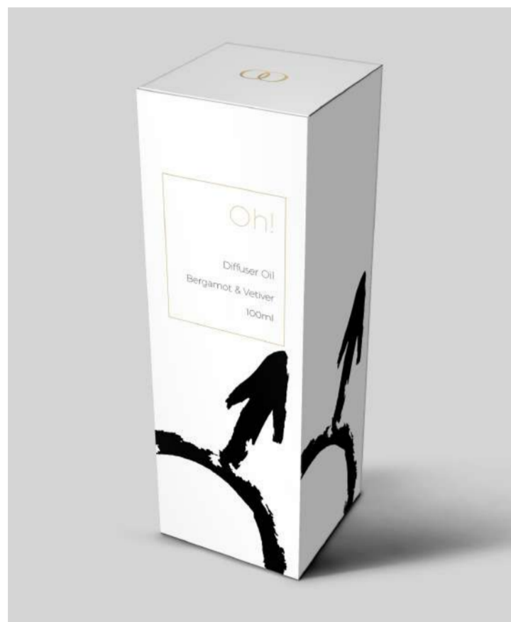
OH! Bergamot & Vetiver