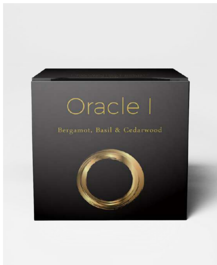
ORACLE I Bergamot, Basil & Cedarwood