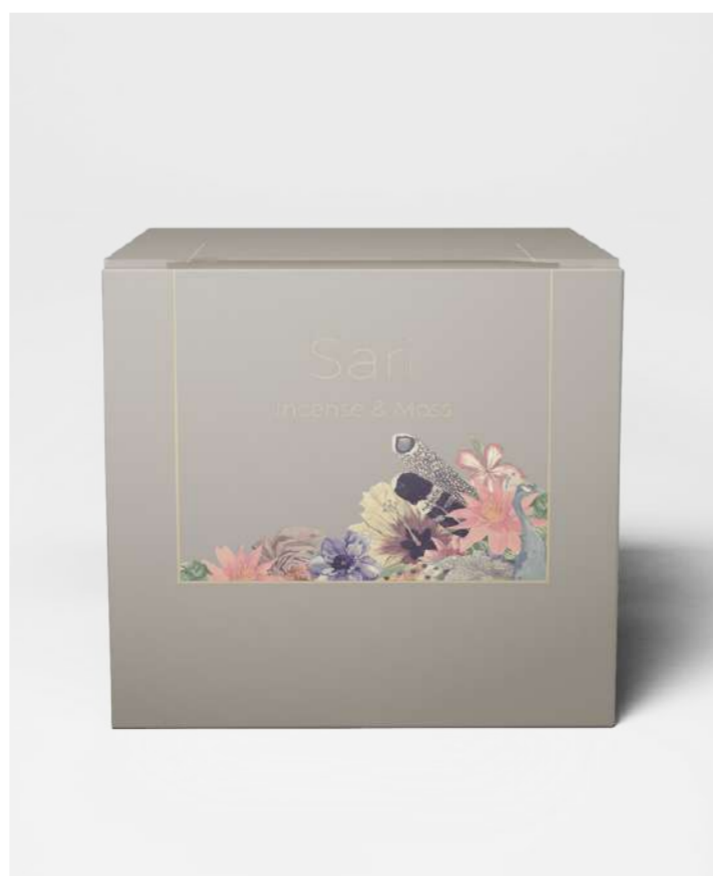
SARI Incense & Moss