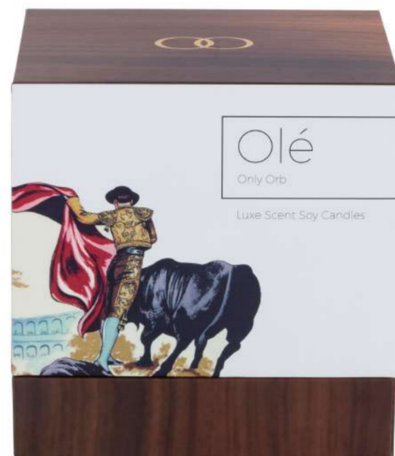
OLE Amber, Wood & Spice